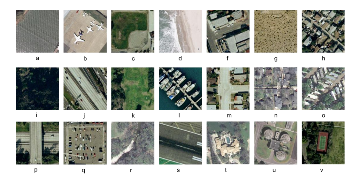
Figure 2. Example of each classes from UC Merced dataset. (a-v) agricultural, airplane, baseball diamond, beach, buildings, chaparral, dense residential, forest, freeway, golf course, harbor, intersection, medium residential, mobile homepark, overpass, parkinglot, river, runway, sparse residential, storage tanks, tennis court.